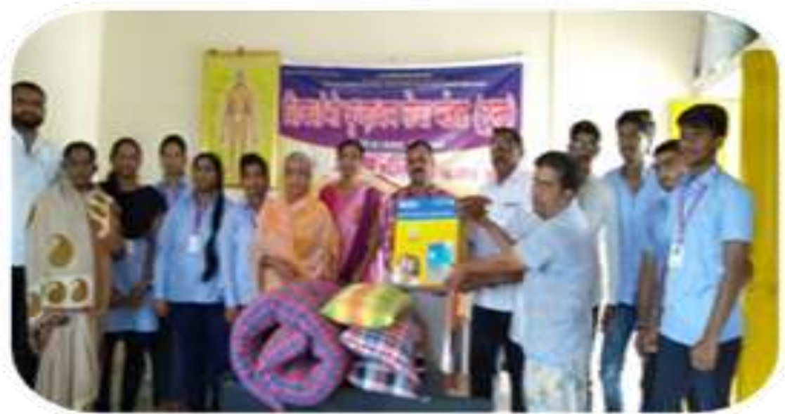
Shiv- Shambho Old Age Home Nerle