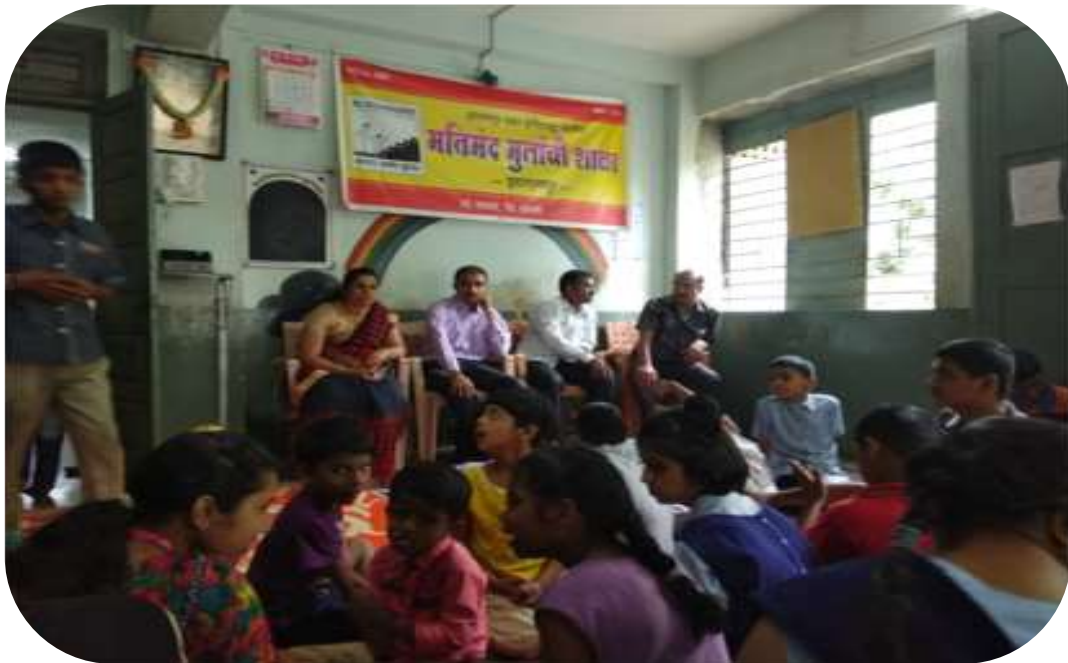
Distribute food to mentally retarded Children