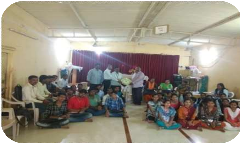
Food Supply and Present of Wall Watch