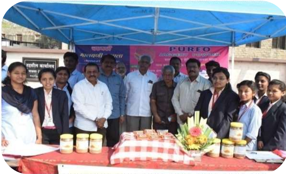
Exhibition and Sale of Jaggery Powder and Malvani Masala