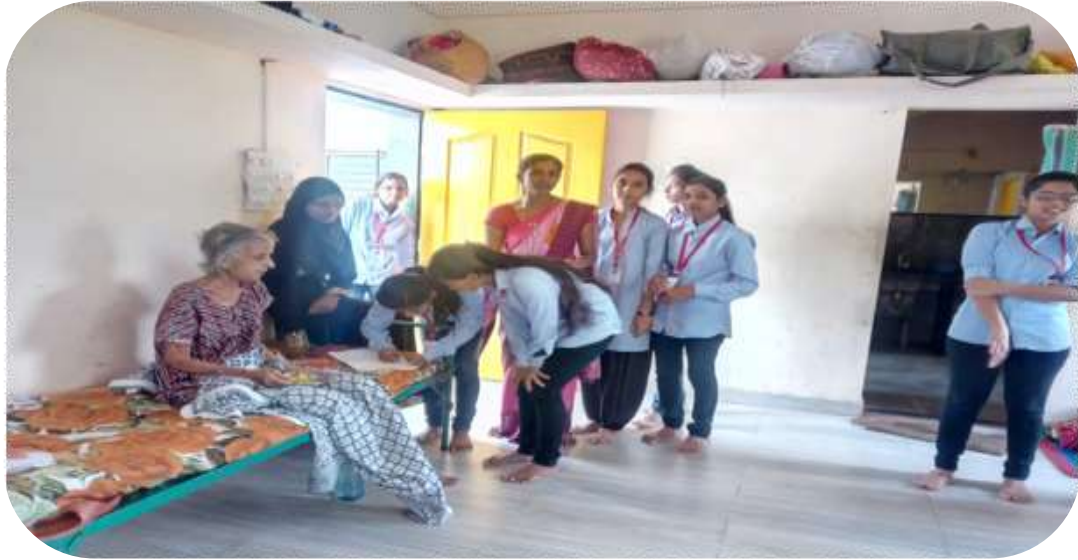
Health Check-up Camp