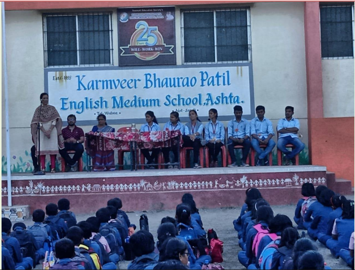
Girls of Vivek Jagar Manch trained High school teacher on how to develop eclipse model