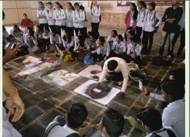
Workshop on How to design Rangoli