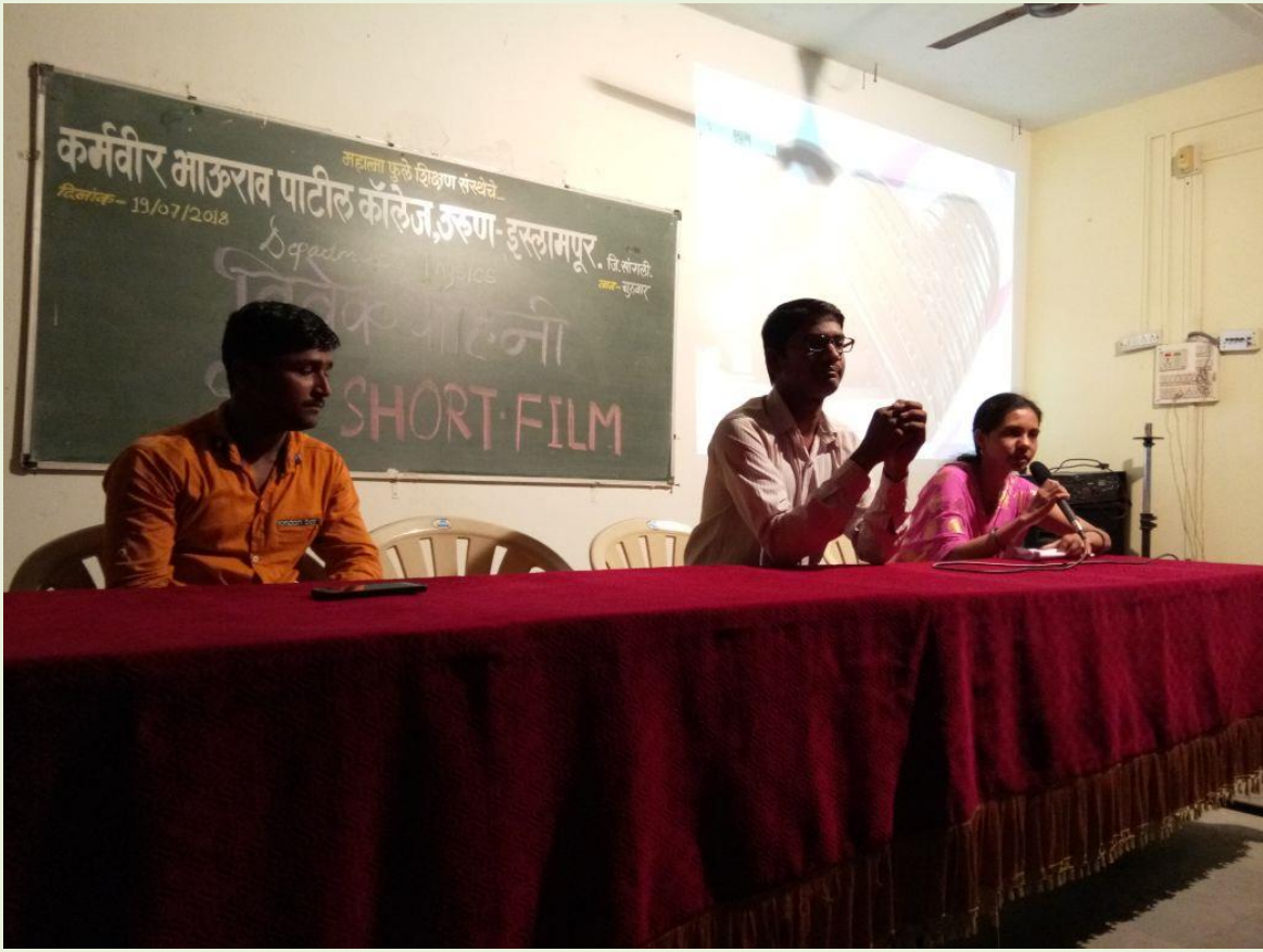
Vivek Film Festival