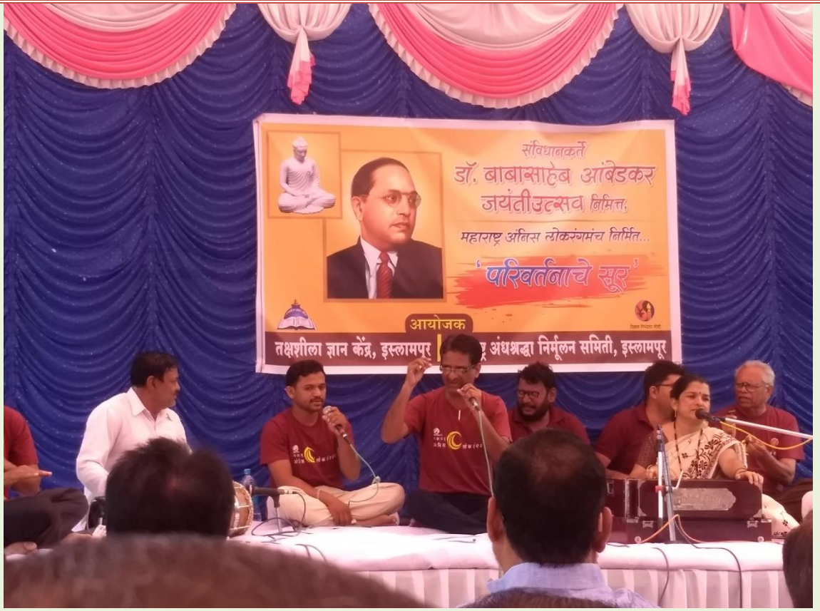
Enlightenment Songs on the occasion of Ambedkar Jayanti