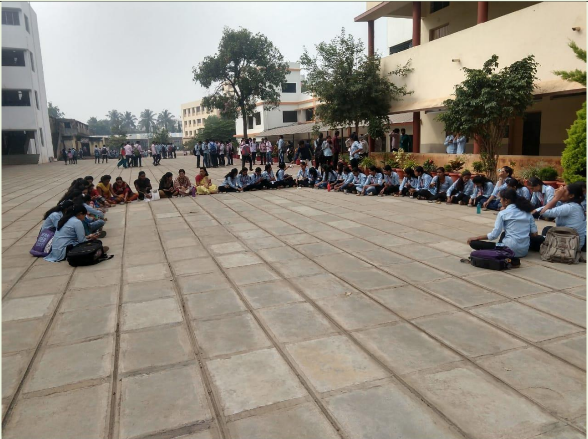
Eclipse Watching at College campus by Vivek Jagar Manch