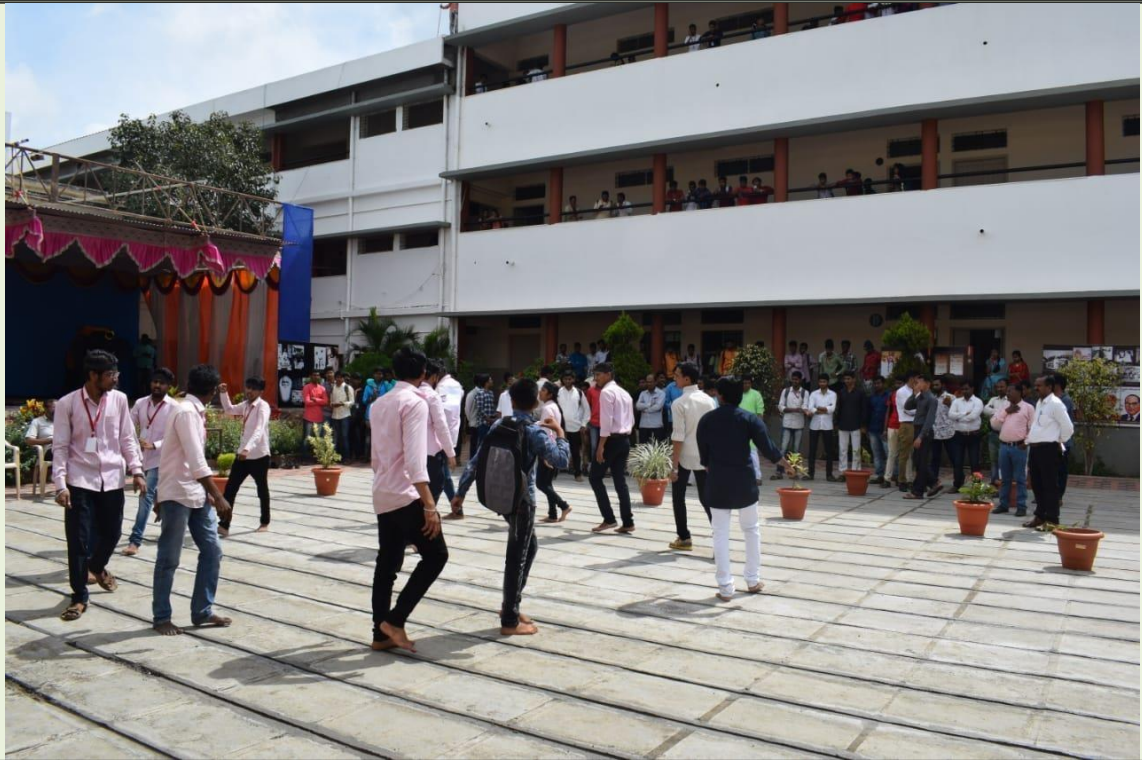
Students of Azad Patra Presenting Street Play on Awareness on