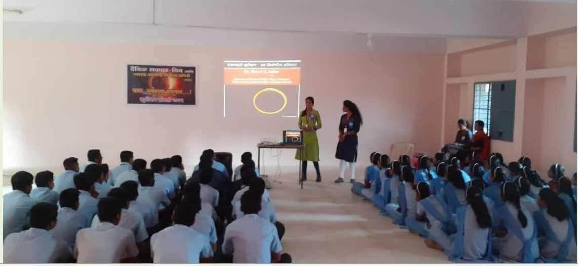
Solar Eclipse: Resource Persons