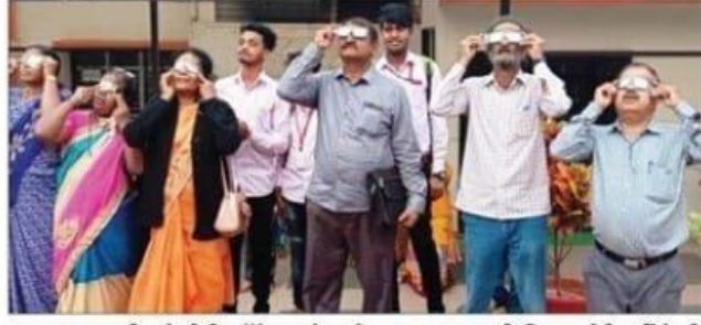
इस्लामपुरातील केबीपी कॉलेजमध्ये सूर्यग्रहण पाहण्यासाठी विद्यार्थ्यांनी गर्दी केली होती.