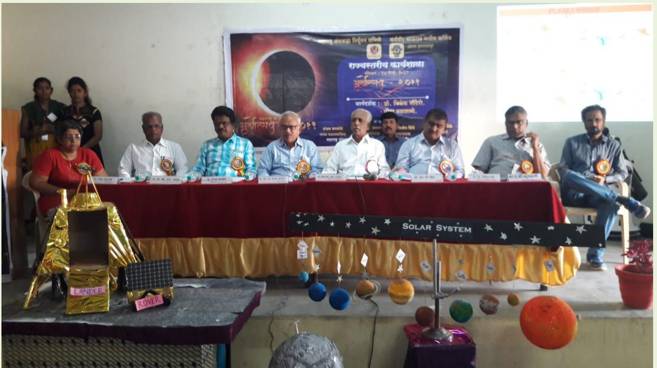
State Workshop on Eclipse