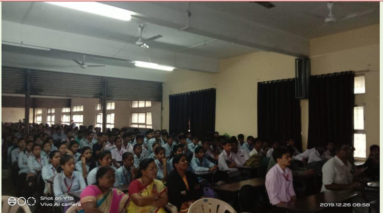
Live Projection of Solar Eclipse at College for students by Vivek Jagar Manch