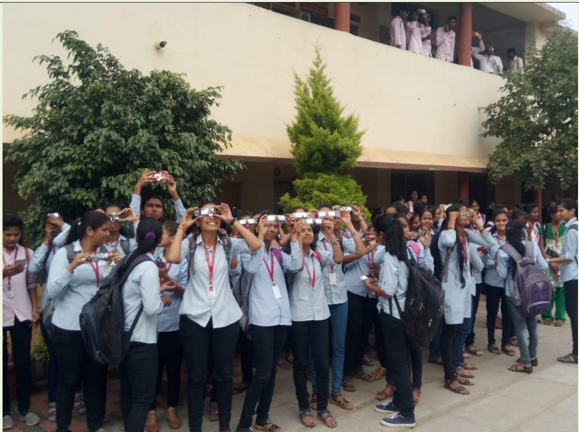
Girls of Vivek Jagar Manch watching Solar Eclipse