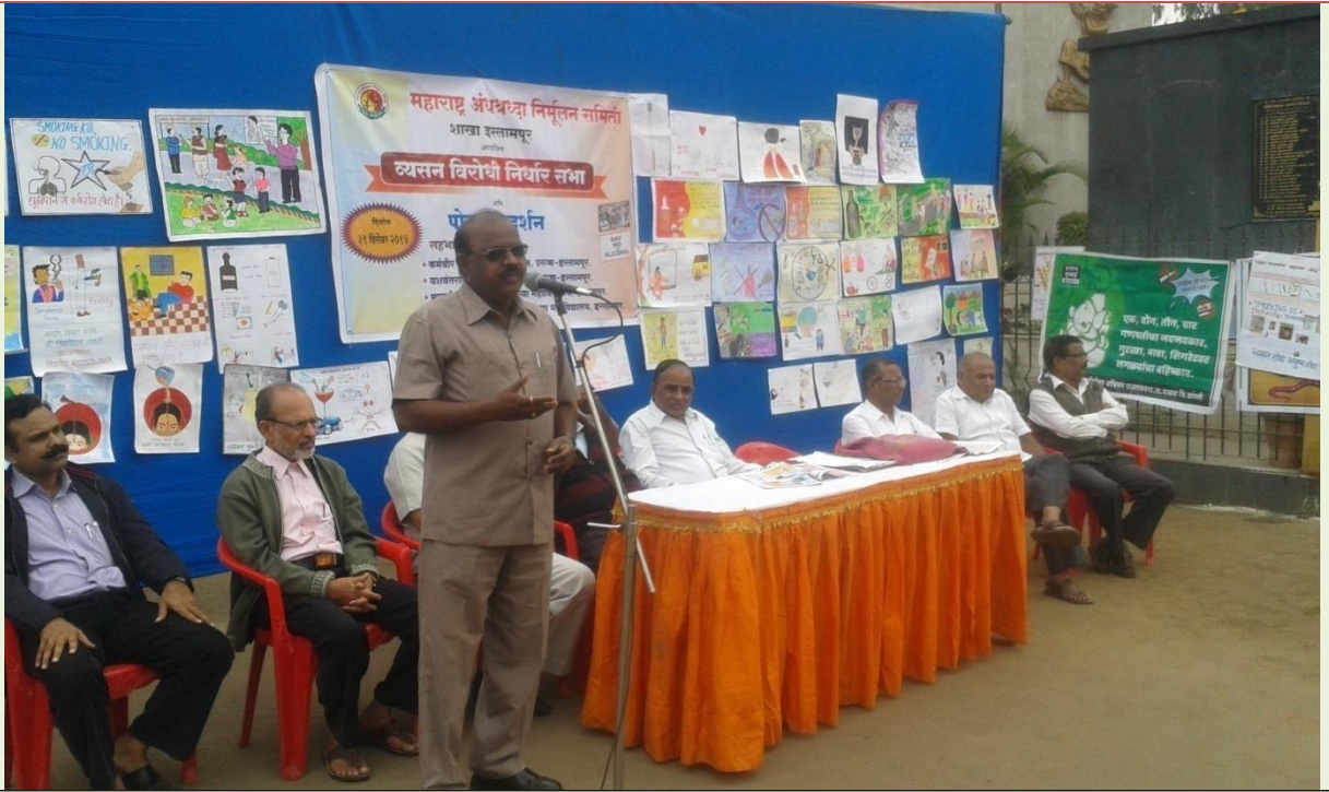
Celebration of 31 st December as Addiction Free Day