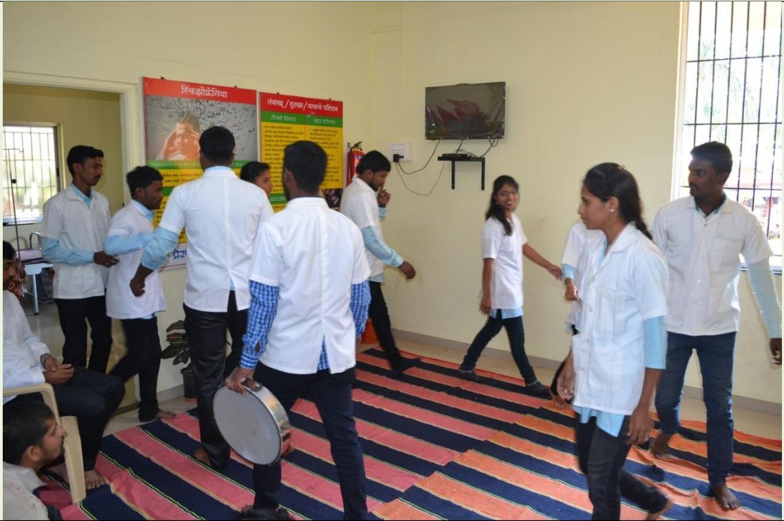
Street Play on Addiction