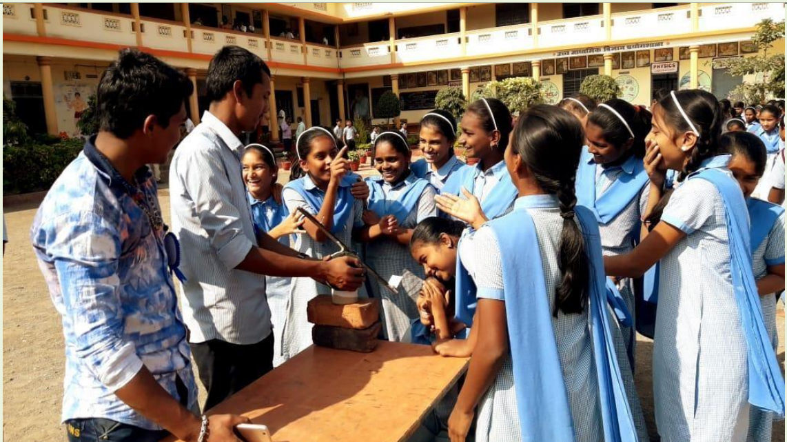
Showing Eclipse Model to Highschool girls