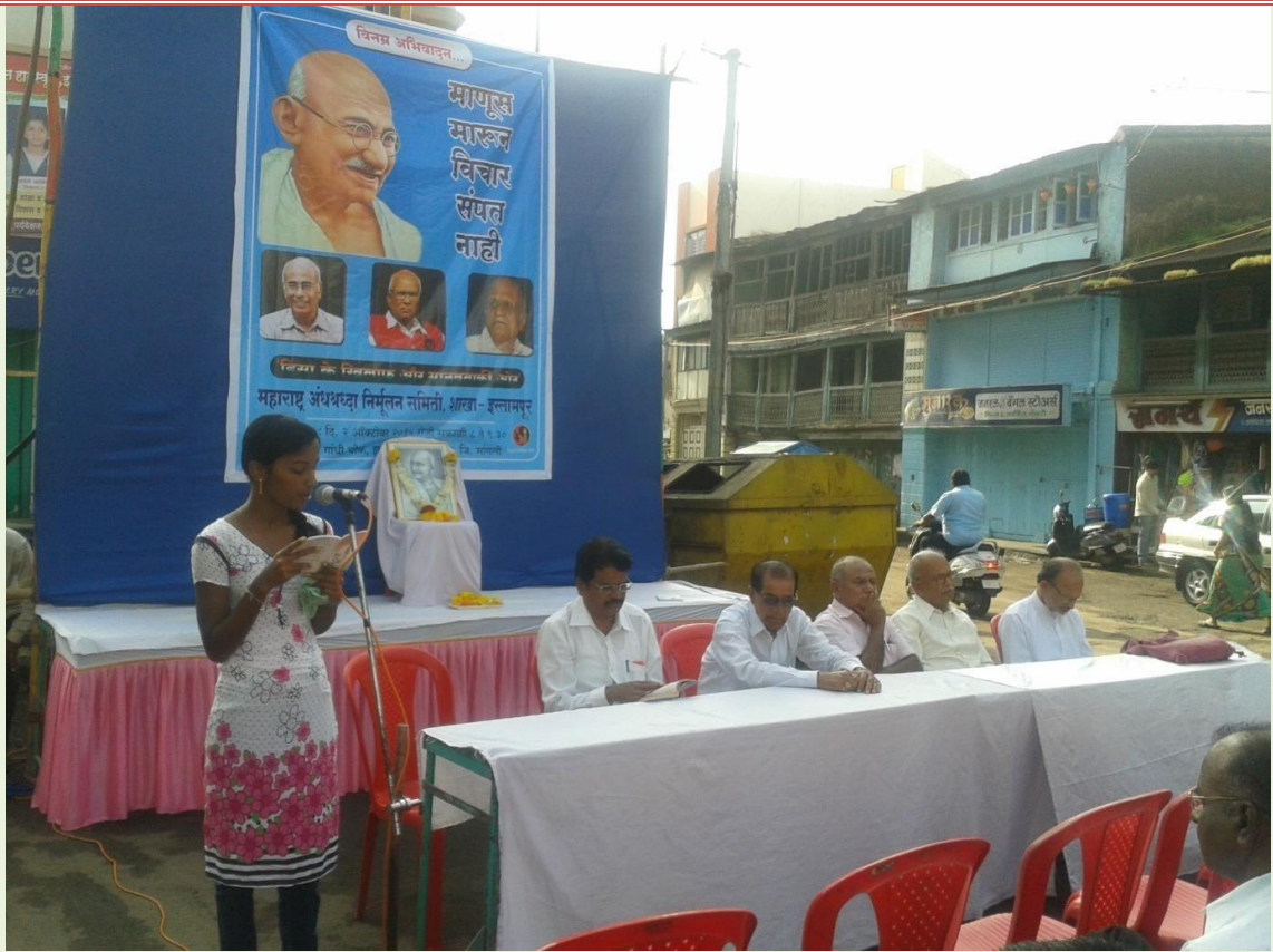
Celebration of Gandhi Jayanti as Humanity Day