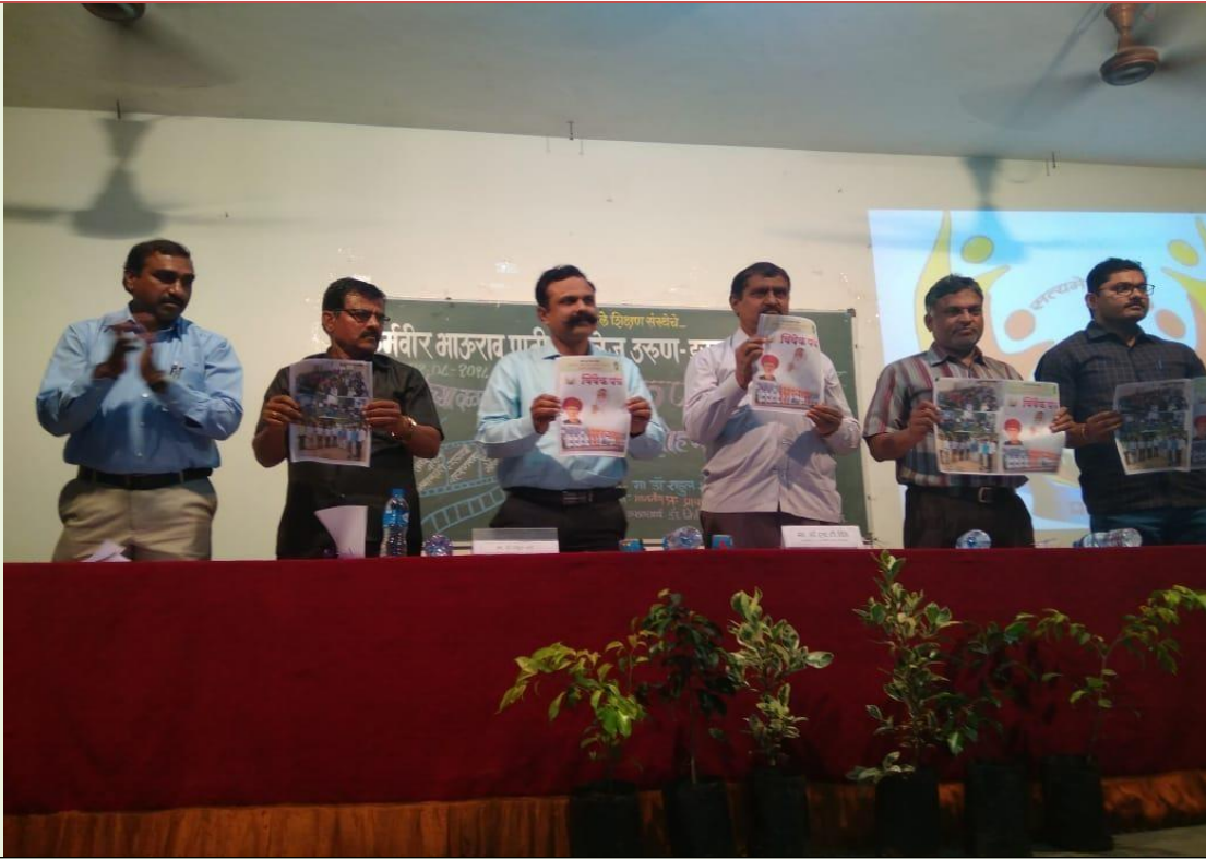
Publication of Vivek Patra