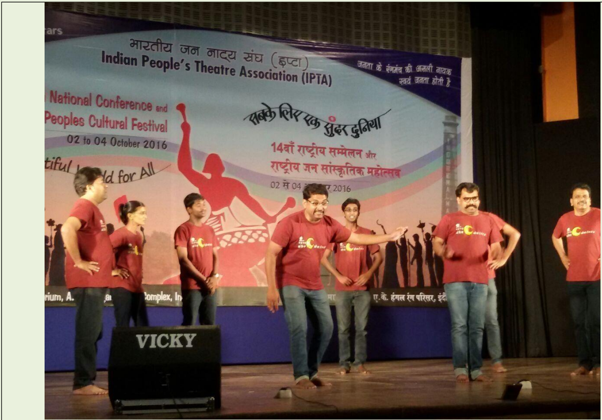
College Students, faculty, alumni present Ringan Natak at Indore