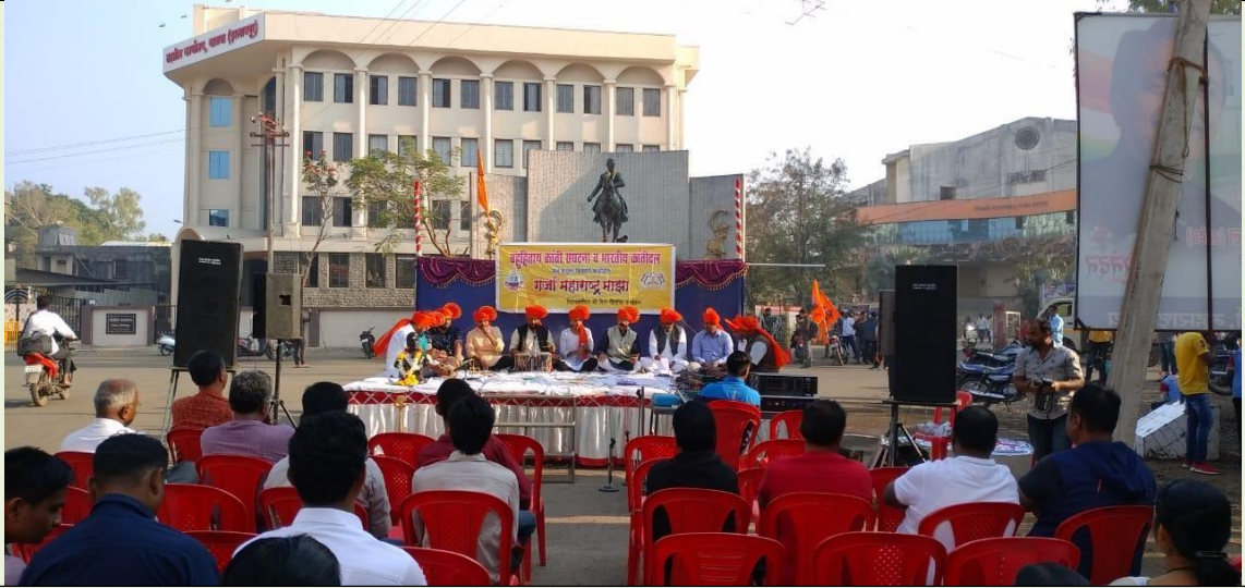
Songs on Chatrapati Shivaji Birth Anniversary: Vivek Jagar Manch: Students, Faculty, and Alumni