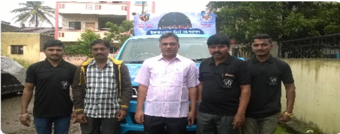
Vidnyan Bodh Vahini